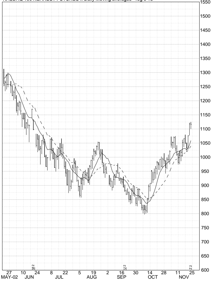
HTTP://WWW.EUROBONDDONLINE.COM NASDAQ 100 NEAREST FUTURES .. Daily Moving averages - reg 9 18